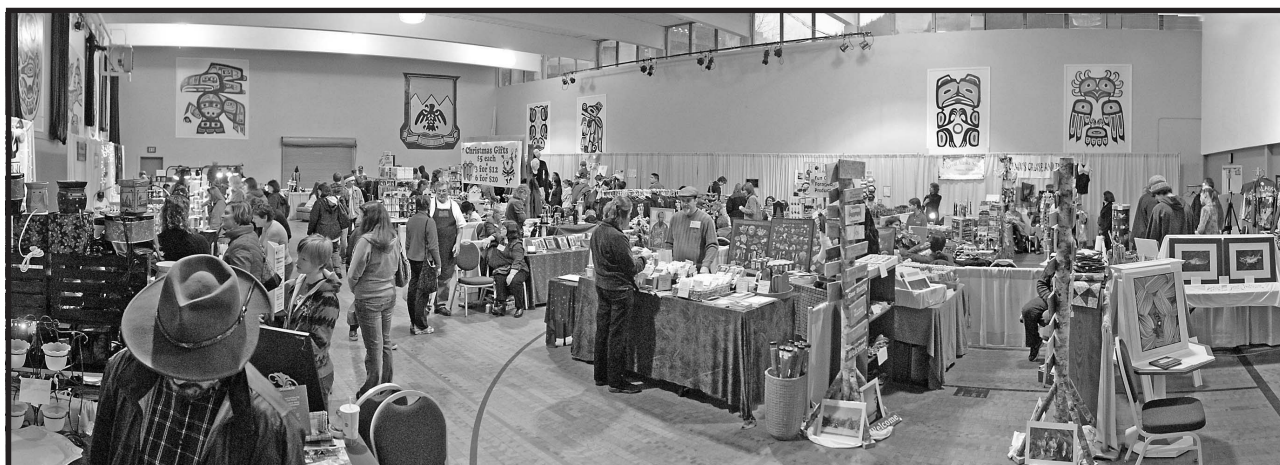
The Public Market Annex

Each Annex booth space is defined by pipe frame & drape separators, with sidewalls that are approximately 3' high. Perimeter booths have an 8' high back, while the center section booths do not. Creative use of each space is encouraged, but please let us know your intentions prior to the event.