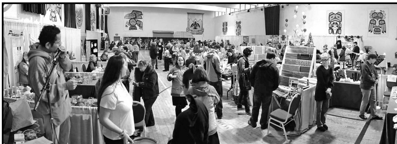
The Public Market Annex

Each Annex booth space is defined by pipe frame & drape separators, with sidewalls that are approximately 3' high. Perimeter booths have an 8' high back, while the center section booths do not. Creative use of each space is encouraged, but please let us know your intentions prior to the event.